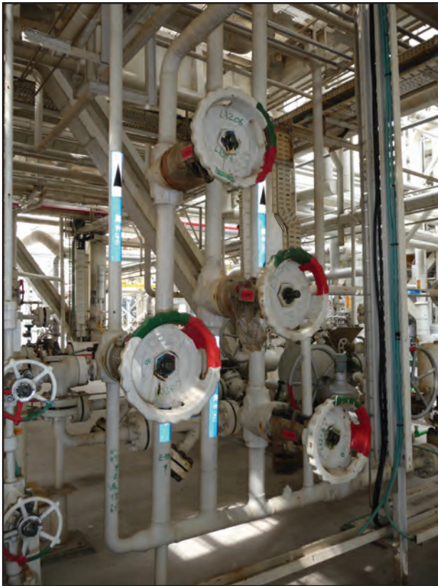
Photo 2. Triple redundant control system

that if the pulsation dampener is at a fixed location, it will be effective for a narrow range of speeds, and ineffective at most of the other speeds of the pump. This was the situation for the operator in this case study.