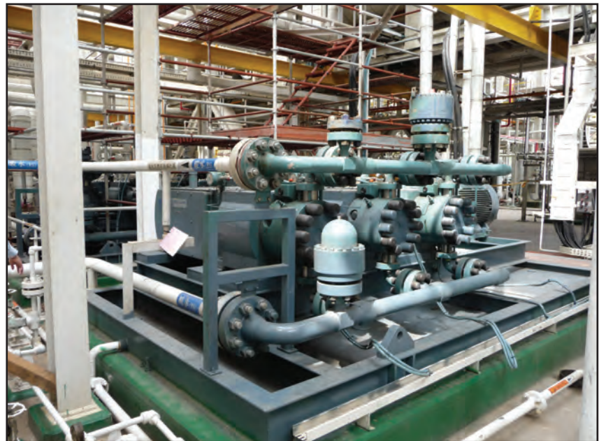
Photo 1. Reciprocating diaphragm pump

A troubleshooting team investigating this problem observed much auxiliary