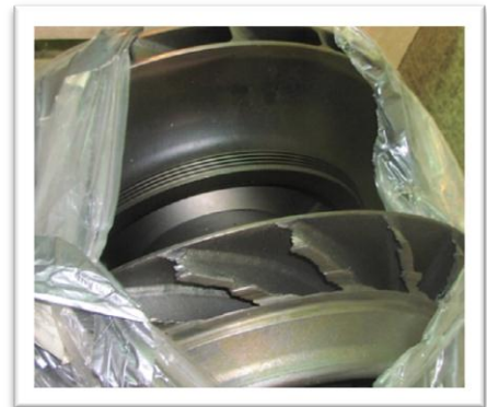
Centrifugal Compressor Damaged During Surge Event

centrifugal compressor system must cope transients. The transients can occur emergency shutdown (ESD), or fast stop. evaluates the system dynamics and operating or reliability problems.