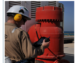
Collect vibration data and email to BETA for analysis