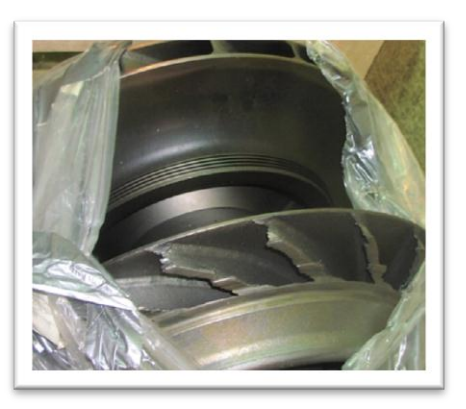
Centrifugal Compressor Damaged During Surge Event

centrifugal compressor system must cope transients. The transients can occur emergency shutdown (ESD), or fast stop. evaluates the system dynamics and operating or reliability problems.