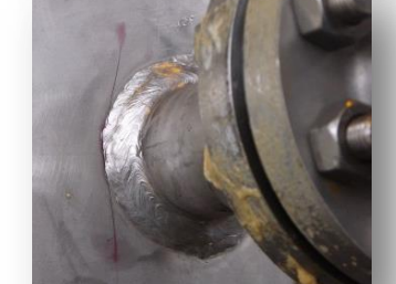
Figure 2: Piping failure examples