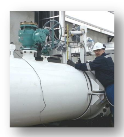
Figure 5: Piping Vibration Assessment (including small bore piping during normal and transient operations)