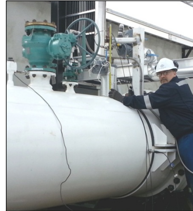
Piping Vibration Inspection Program using Multichannel Data Acquisition to assess vibration at different operating conditions

Second, the field inspection team will measure vibration, mechanical natural frequencies, and stress (if required) at these locations using specialized hardware and software tools. The inspection program must consider transient related vibration due to equipment or processes starting or stopping, or changing operating conditions. For example, changes in speed or flow can create resonance conditions that amplify the vibration above safe limits.